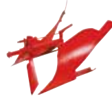
TURN-WREST PLOUGH 90°