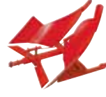
TURN-WREST PLOUGH 180°